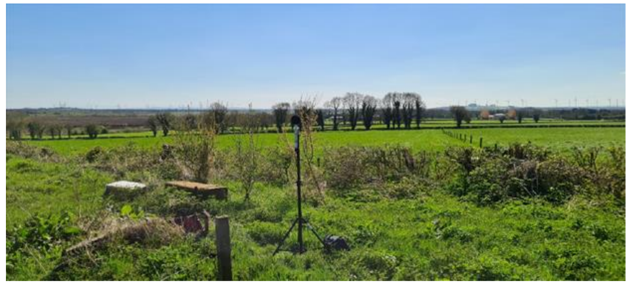
Plate 3: View of Location M3.

Location M4 (Coordinates: 53.3429941; -7.2469539) is an isolated farmhouse in Togher. It is surrounded by open bogland on its northern and western sides, and open farmland to the south and west.