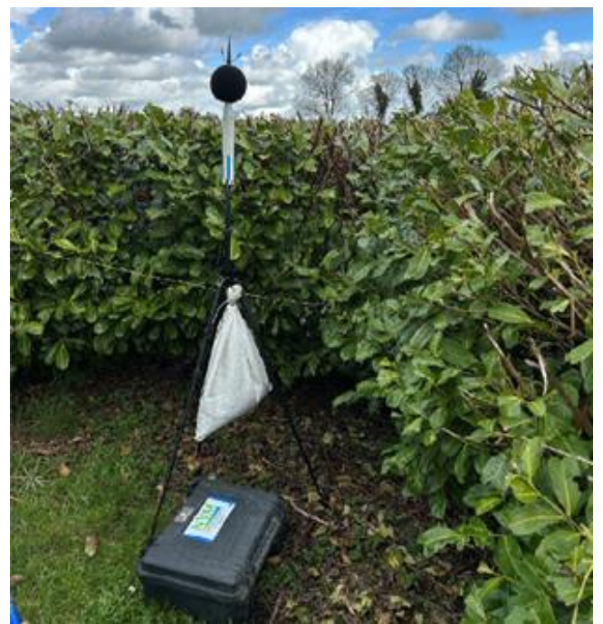
Plate 7: View of Location M7.

Location M7 (Coordinates: 53.4044058; -7.2801307) is a residential property in Rahanine, Co. Westmeath. It is within 160m of the off-ramp from the M6 motorway at the Rochfortbridge exit, junction 3. It is also 2km northwest of the Derrygreenagh facility. Its immediate surroundings are open farmland, with the Derrygreenagh bog to the southeast.