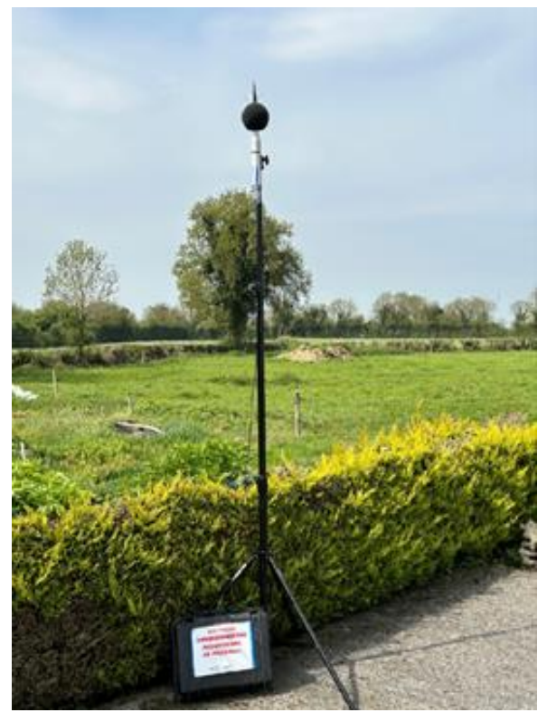
Plate 5: View of Location M5.

Location M6 (Coordinates: 53.3872659; -7.2408631) is on the edge of the bog area to the east of the Derrygreenagh facility. There are residential properties further up the road.