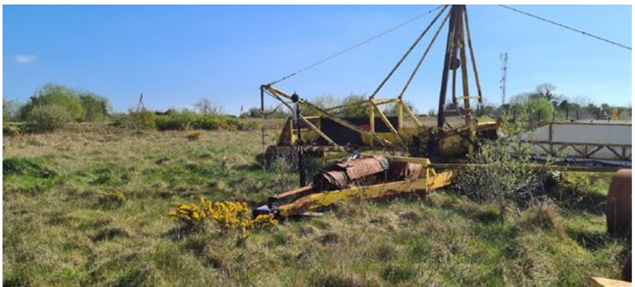
Plate 8: View of Location M8.

Location M8 (Coordinates: 53.3922107, -7.2536459) is within the Derrygreenagh facility on the western edge of the compound. It is surrounded on all sides by open bogland. The noise levels here would also be affected by the operation of the facility, with slow moving vehicles.