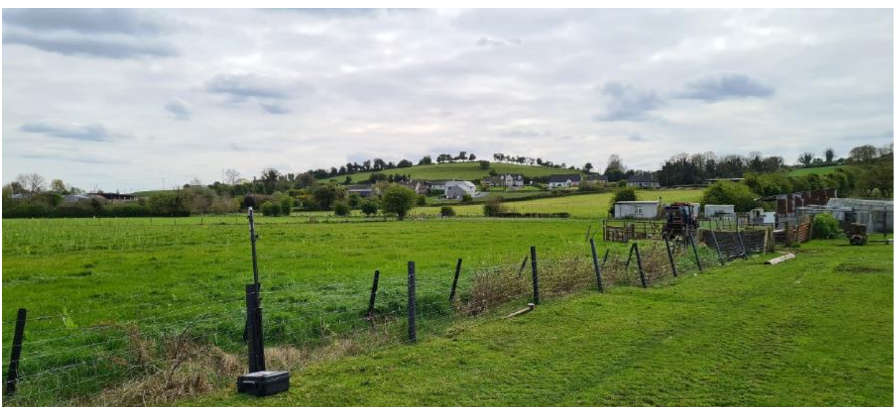
Plate 4: View of Location M4.

Location M4 (Coordinates: 53.3429941; -7.2469539) is an isolated farmhouse in Togher. It is surrounded by open bogland on its northern and western sides, and open farmland to the south and west.