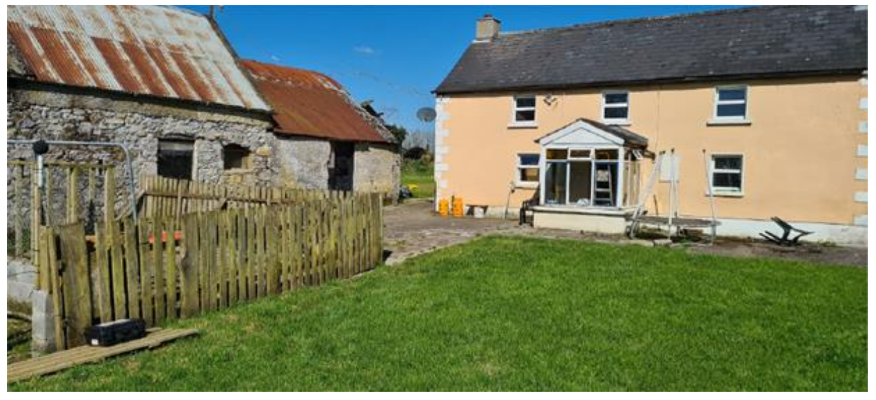
Plate 1: View of Location M1.

Location M2 (Coordinates: 53.3287816; -7.2520075) is a working dog kennel located to the west of Location M1 at the end of a long cul-de-sac, also in Coole. It is surrounded by open farmland. The nearest open bog is approximately 800m to the east.